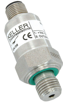
Series 23 SY

The Series 23 SY / 25 Y product line is outstanding due to its extreme ruggedness towards electromagnetic fields. The limits of the CE standard are undercut by a factor of up to 10 with conducted and radiated fields.